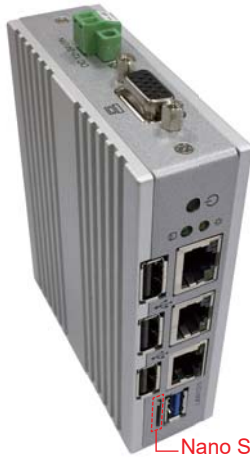
↳ Nano SIM (Option)

Compact Fanless Embedded Computer with Intel® Bay Trail Processor