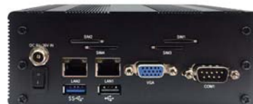
2I386EW / 2I385EW + L2M001 Back Panel

M/B information: ( Please refer to M/B specification )