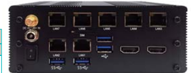
2I392CW + L2L001 Back Panel