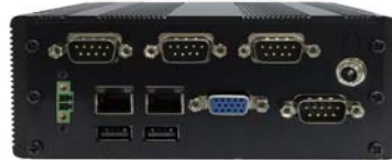
2I386EW / 2I385EW / 2I385CW Back Panel