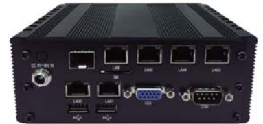
2I386EW / 2I385EW + L2L002 Back Panel