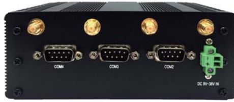
2I386EW / 2I385EW + L2M001 Front Panel (OEM)