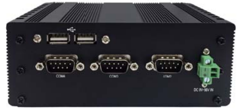
2I386EW / 2I385EW + L2L002 Front Panel (OEM)