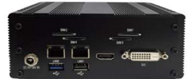
2I390CW + L2M001 Back Panel

M/B information: ( Please refer to M/B specification )