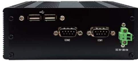
2I392CW + L2L001 Front Panel (OEM)