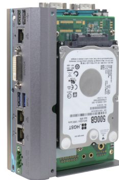
▲ POC-300 with MeziO™ - R11 and 2.5" HDD

** For sub-zero operating temperature, a wide temperature HDD drive or Solid State Disk (SSD) is required.