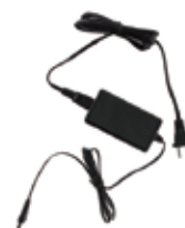
ADA12D0 Power Adapter