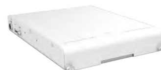
Medical Expansion Power Bank