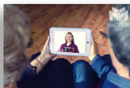
Remote Mobile Medical Service