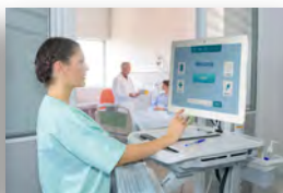
Daily Patient Management