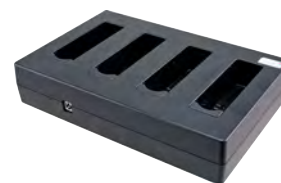
4 Bay Battery Charging Station