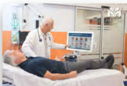
Medical & Healthcare